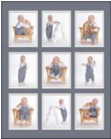
16x20 Panel with 9-4x5s $195