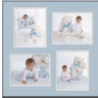
12x12 Panel with 4-4x5s $95